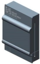
Battery Board BB 1297 f. CPU 12xx